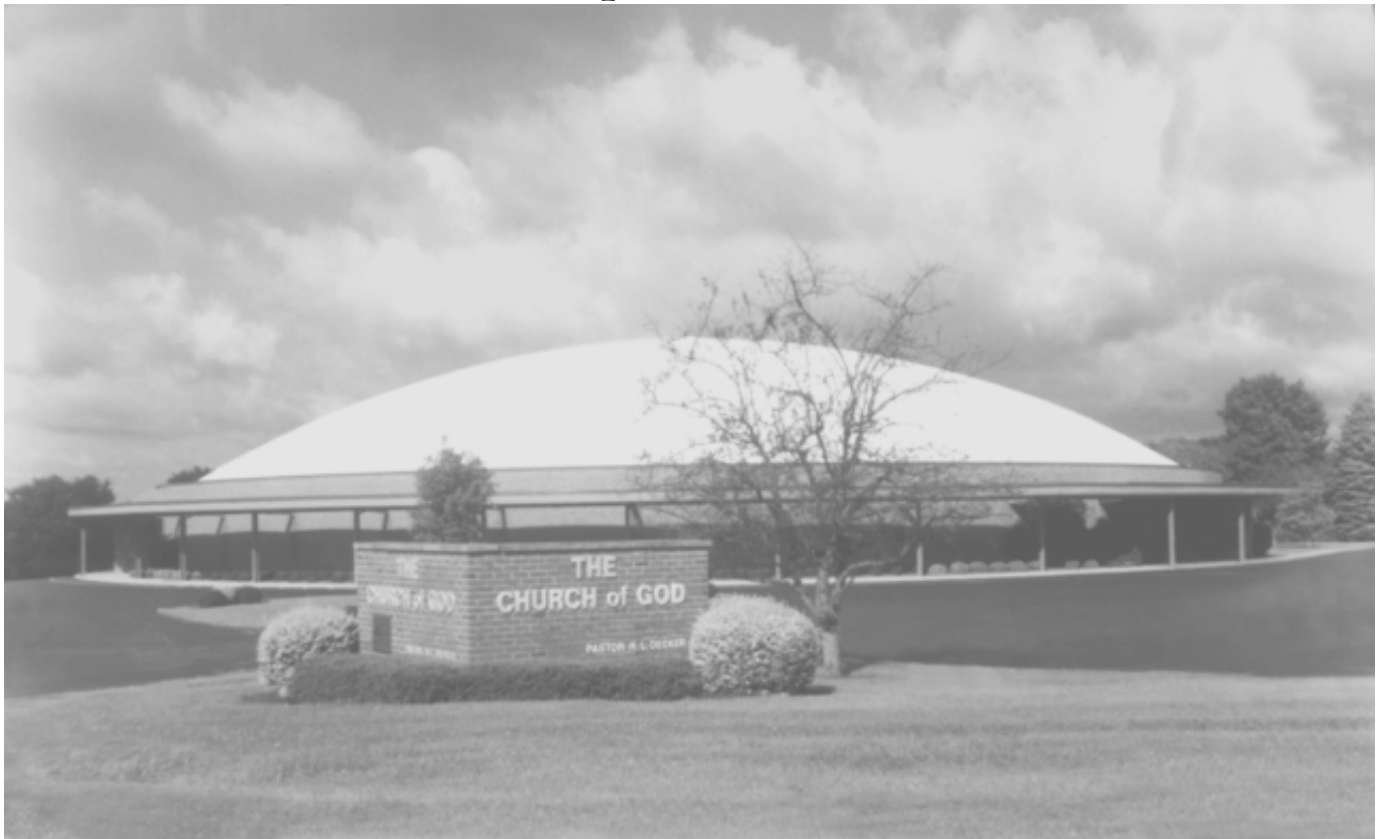
Church of God Tabernacle in Newark, Ohio

"I was glad when they said unto me, Let us go into the house of the Lord."