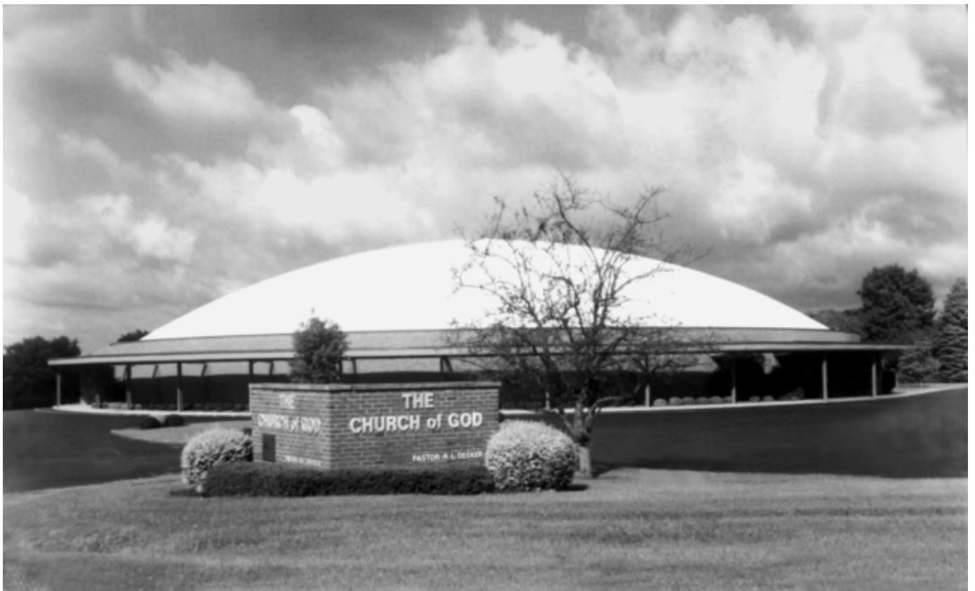
Church of God Tabernacle in Newark, Ohio

"I was glad when they said unto me, Let us go into the house of the Lord."