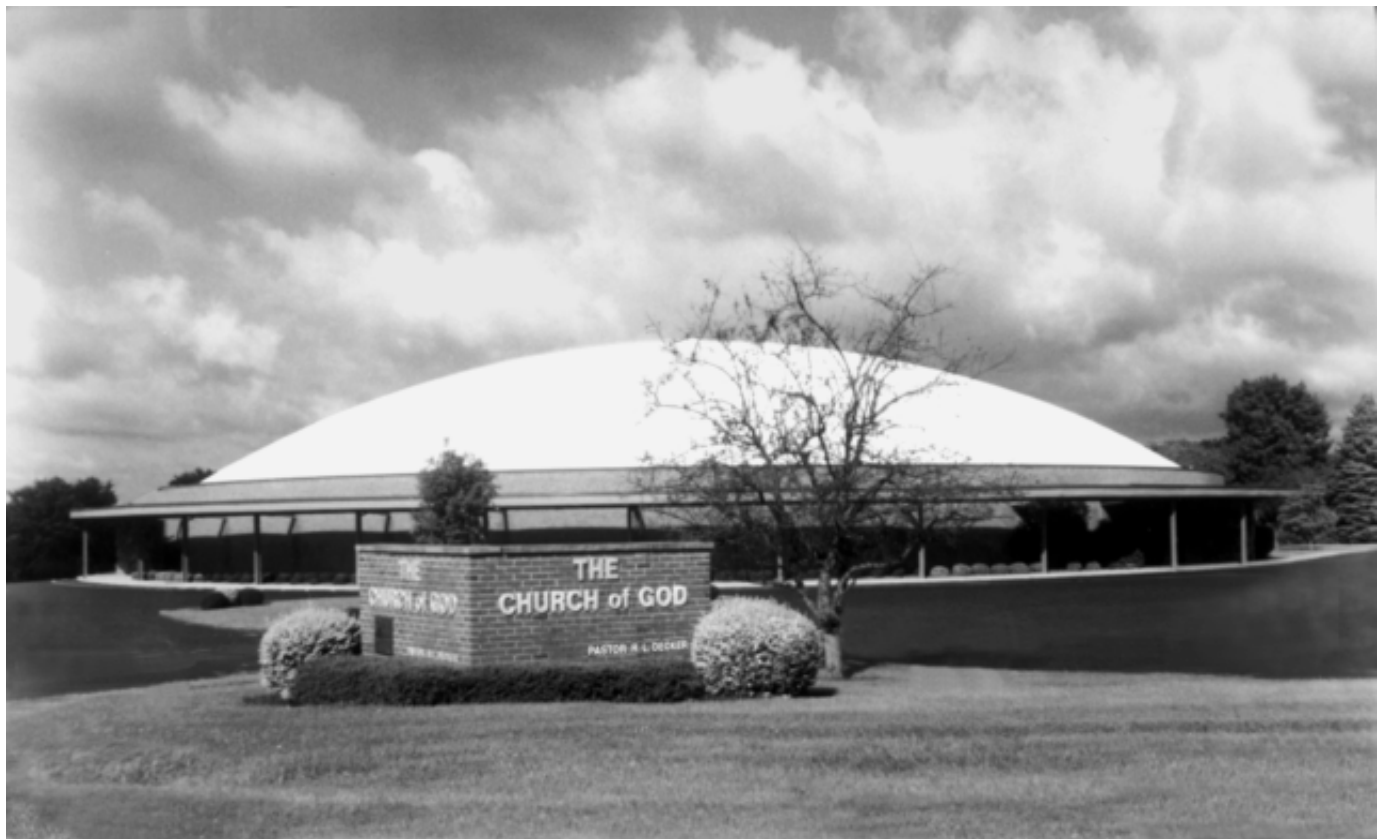
Church of God Tabernacle in Newark, Ohio

"I was glad when they said unto me, Let us go into the house of the Lord."