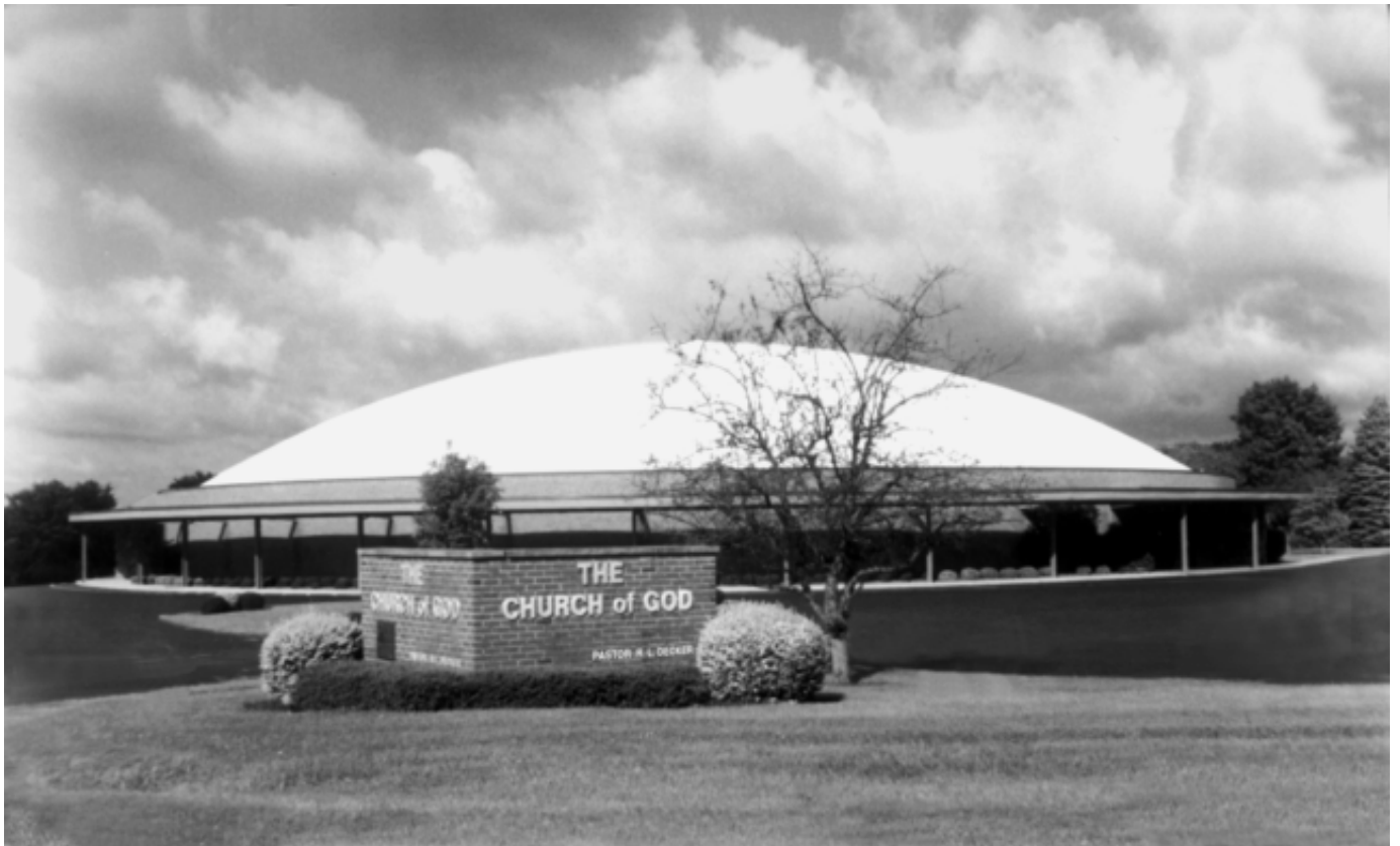
Church of God Tabernacle in Newark, Ohio

"I was glad when they said unto me, Let us go into the house of the Lord."