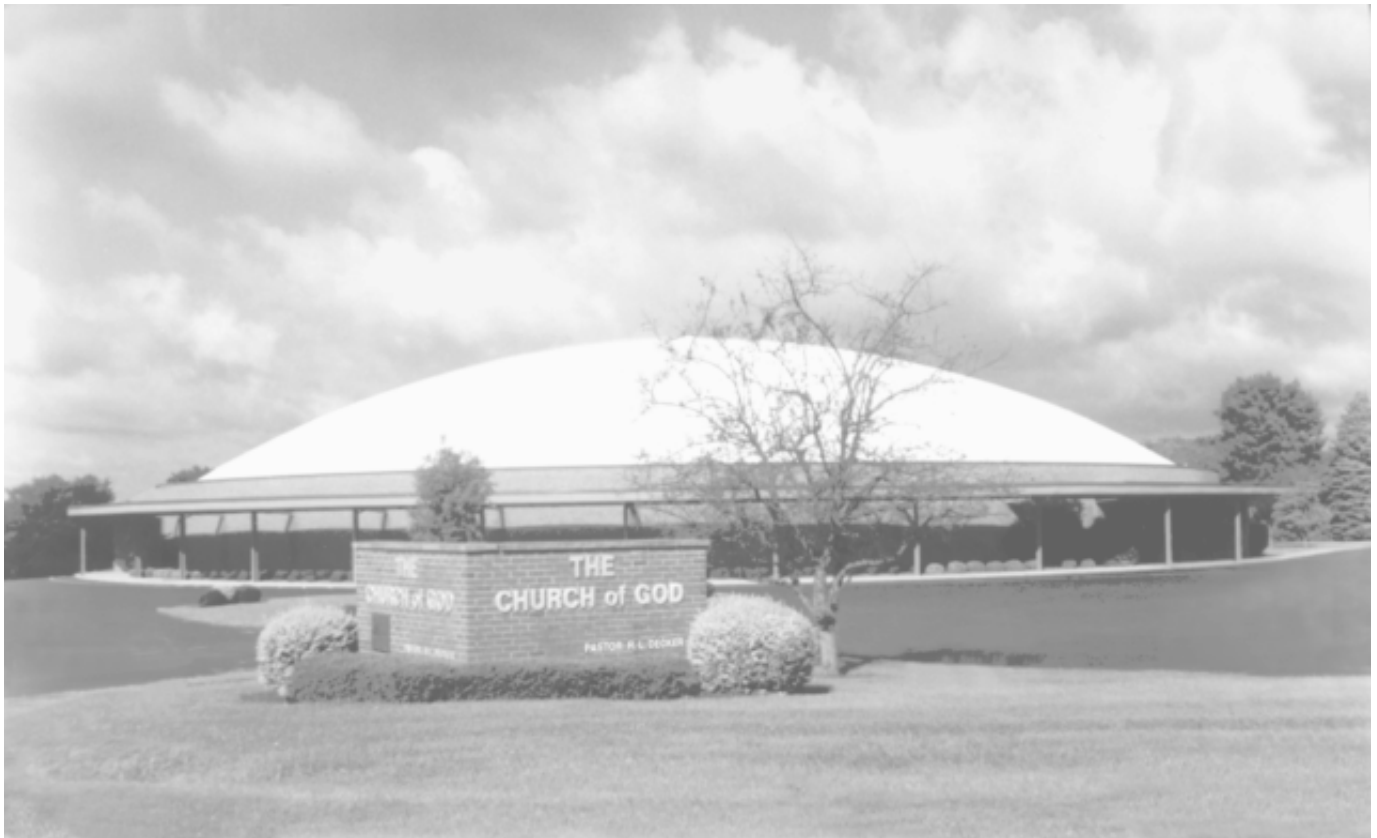
Church of God Tabernacle in Newark, Ohio

"I was glad when they said unto me, Let us go into the house of the Lord."